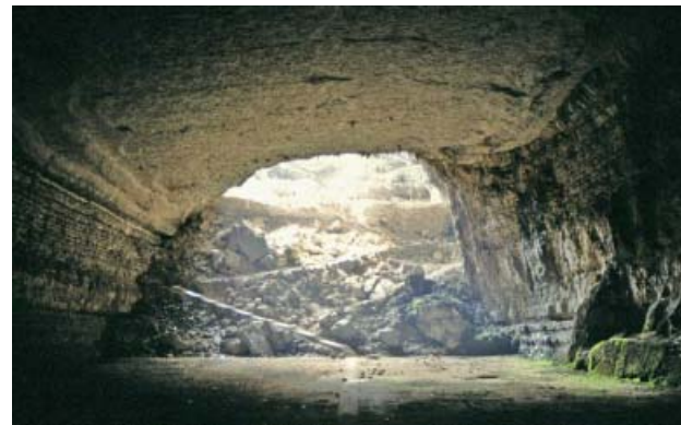
Fig. 3. The truncated cave passage of Tiencuan Dong looking towards the debris pile in the eastern slope of Xiaoyanwan tiankeng; scale is given by the footpath with 30 steps up to the first switchback.

underground river (from the Xia Dong sink to the Donghe Dong resurgence) is accessible by a small shaft beneath Spider Cavern, and has been mapped as far as a sump beneath Xiaoyanwan (Fig. 6). This lies 70 m below the daylight floor of the tiankeng, and it is unknown if there is any connection between the active river cave and the Xiaoyanwan tiankeng.