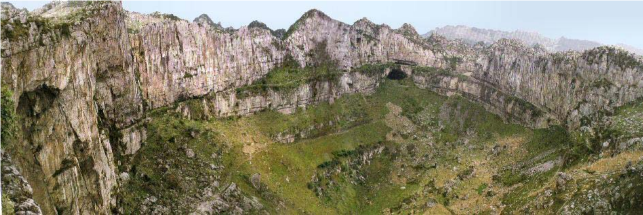
Fig. 2. Looking east along the length of the Xiaoyanwan tiankeng; on the lower slopes, note the bedrock ribs on the north side (left) contrasting with the debris ramp on the south side (right).

Though the upper half of the tiankeng profile has vertical cliffs, the lower half tapers to a small, dry, grass-floored apex. Most of the lower slopes are ramps of scree that are covered by thin soil and vegetation, though there are some active runs of bare rock debris. Significantly, these lower slopes across the northern side of the tiankeng are broken by two bedrock cliffs (Fig. 2); the lower cliff is natural, but the upper scar has been enhanced by a vehicle track cut into it; small banks of scree stand between successive cliffs.