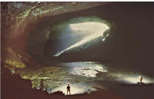
Fig. 5. The Entrance Chamber of the Zhucaojing cave system looking west.