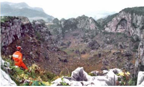
Fig. 4. The degraded tiankeng of Dayanwan, seen from its eastern rim, with the edge of its deep internal doline visible in the foreground.