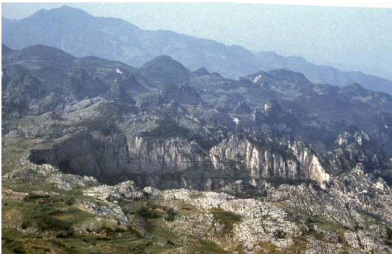
Fig. 1. A distant view of Xiaoyanwan, seen from high on a mountain in the sandstone cover, with the crest of the Xingwen escarpment forming the nearer skyline profile.

This fine example of a mature tiankeng is a huge collapse doline ringed almost completely by vertical limestone cliffs over 100 m high. It is almost circular in plan, 625 m long and 475 m across, and its rim cuts through twelve conical hills and the intervening solution dolines within the karst. The highest point on the rim cliffs stands 248 m above the lowest point in the tiankeng, while the lowest col on the rim is still 178 m above the tiankeng floor. Its volume is therefore about 36M m 3 .