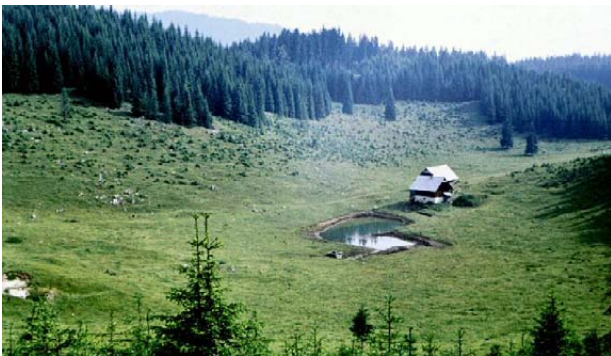
Fig. 2. Kranjska Planina konta , a glaciokarstic depression used for summer pasture

There are many large and deep depressions on the higher Dinaric and Pre-Alpine plateaus. Some of these could have a collapse origin, or collapse process at least played an important role in their genesis. One important type of depression is known as a konta ; this is a local name, but it does appear in the Slovene karst terminology (Gams, 1973). A konta is a closed karst depression, like a doline, that has been remodelled during Pleistocene glaciation. Thus it is viewed among glaciokarstic landforms, or as a polygenetic karst depression of multiple origins. It is difficult to decide if the original depression was a solution or a collapse doline. On the floor of a konta , thick unconsolidated sediment (normally of glacial till) has accumulated, and creates a local aquifer, so that small springs occur. The combination of good soil and reliable water is the basis for the economic use of the konta in farming. A good example is the konta of Kranjska Planina on the Pokljuka plateau, which is used as a summer mountain pasture (Fig. 2).