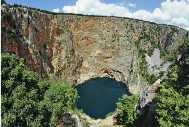
Fig. 3. The Crveno Jezero collapse doline near the town of Imotski.

Consequently most of these great depressions do not have the characteristics (or at least do not have enough characteristics) to be classified among the collapse dolines (that form by collapse into cave passages). Their collapse origins remain open to debate.