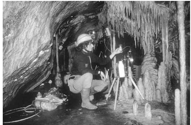
Fig. 2. In-situ measurement and sampling in the Père Noël cave.

the water residence time in the vadose zone, linked to changes in amount of precipitation. These studies demonstrated that the changes in chemistry of cave waters, and consequently in speleothems, could reflect changes in effective precipitation (or recharge) (Roberts et al., 1998; Fairchild et al., 1999, 2000; Verheyden et al., 2000). Incongruent dolomite dissolution was also demonstrated to be responsible for the anti-correlation between Mg and Sr content and between Ba and Mg content in a New Zealand flowstone by Hellstrom et al. (2000). Changes in the contribution of weathering linked with changes in rainfall intensity were invoked to explain changes in the Sr, Ba and U contents of speleothems by Bar-Matthews et al. (1999) and Ayalon et al. (1999). During colder and dryer periods, higher trace element concentrations reflect an increase in exogenic sources (sea spray and Aeolian dusts), and a reduced contribution of weathering from the host dolomites.